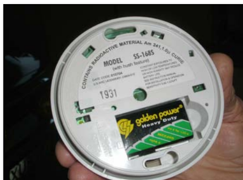
NZ Fire Service caught red-handed! Still fitting IONS

Three IONISATION ALARMS (ions) were fitted in Freda's unit previously by the Fire Service [who stated: "that she had working ion smoke alarms" in a press release] and of course they did not work! The Fire Service said it was a tragedy that she was overcome by smoke! They have now re-fitted all adjacent pensioner units with new IONISATION ALARMS see images below.