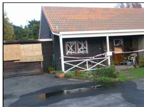
Freda Birch's burnt out unit

The recently fitted new alarms have no brand name but are made in China with 'el cheapo' batteries! Already the one pictured in neighbouring unit was beeping, so the battery may already be suspect after being fitted for one day.